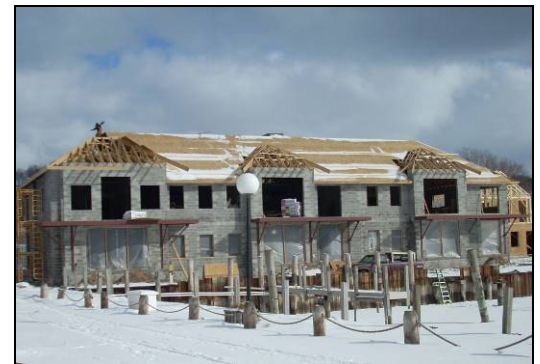
Under construction – South Elevation